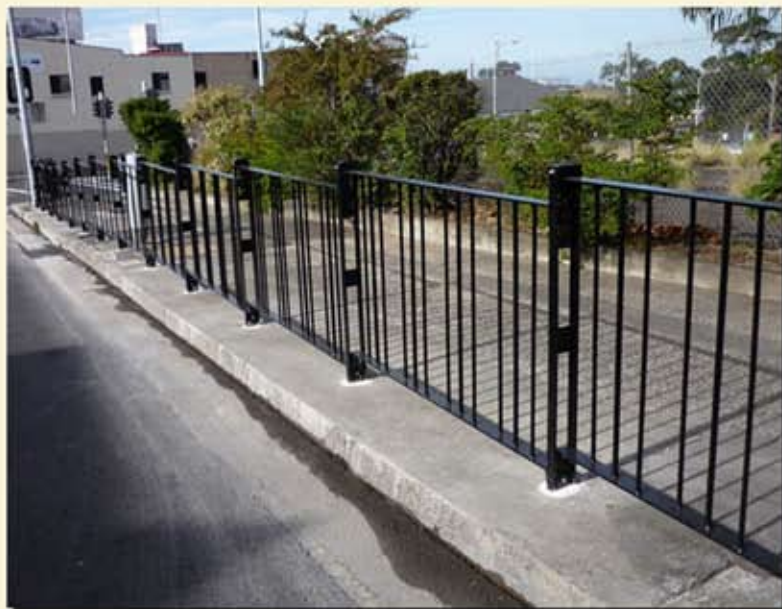
Type - 1

Encat supply, install and repair all styles of pedestrian fence.